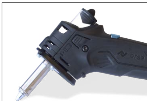
Transparent solder container