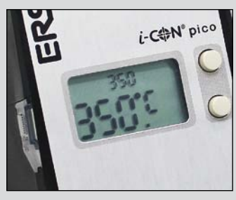
Intuitive operation by means of two buttons

i-CON pico soldering station complete with i-Tool pico (0130CDK) soldering iron with chisel-shaped tip (0102CDLF16) 1.6 mm and tool holder.