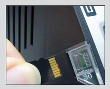
Micro smart SD card for parameterization of the i-CON pico