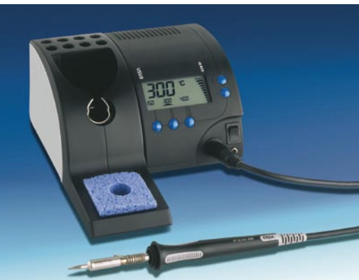
Fig.: Microprocessor-controlled digital power soldering station

Precise temperatures can be selected between 150°C and 450°C (302°F - 842°F), and with a touch of a button, 3 fixed temperatures or 2 fixed temperatures and one stand-by temperature can be programmed and selected.