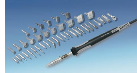
Fig.: Soldering iron RT 80 with optional soldering tips